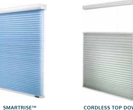
CORDLESS TOP DOWN/ BOTTOM UP