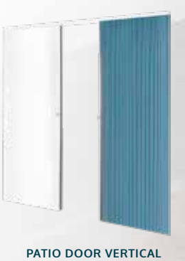
DAY & NIGHT